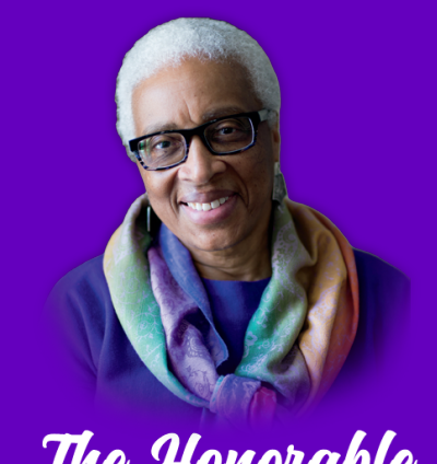
The Honorable Geraldine S. Hines